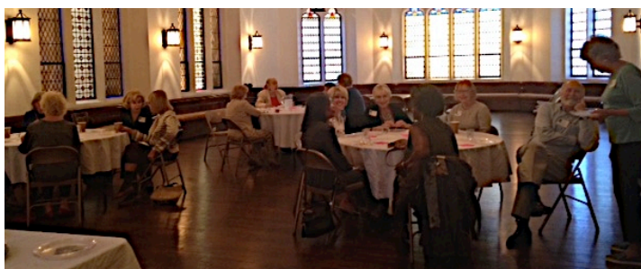
Women of Wit & Wisdom's Inaugural Luncheon of Women, held in October.

ways Art Historians work and then look at works on paper by Auguste Rodin and Marguerite Zorach with microphotographs. This was a most enjoyable cultural event!