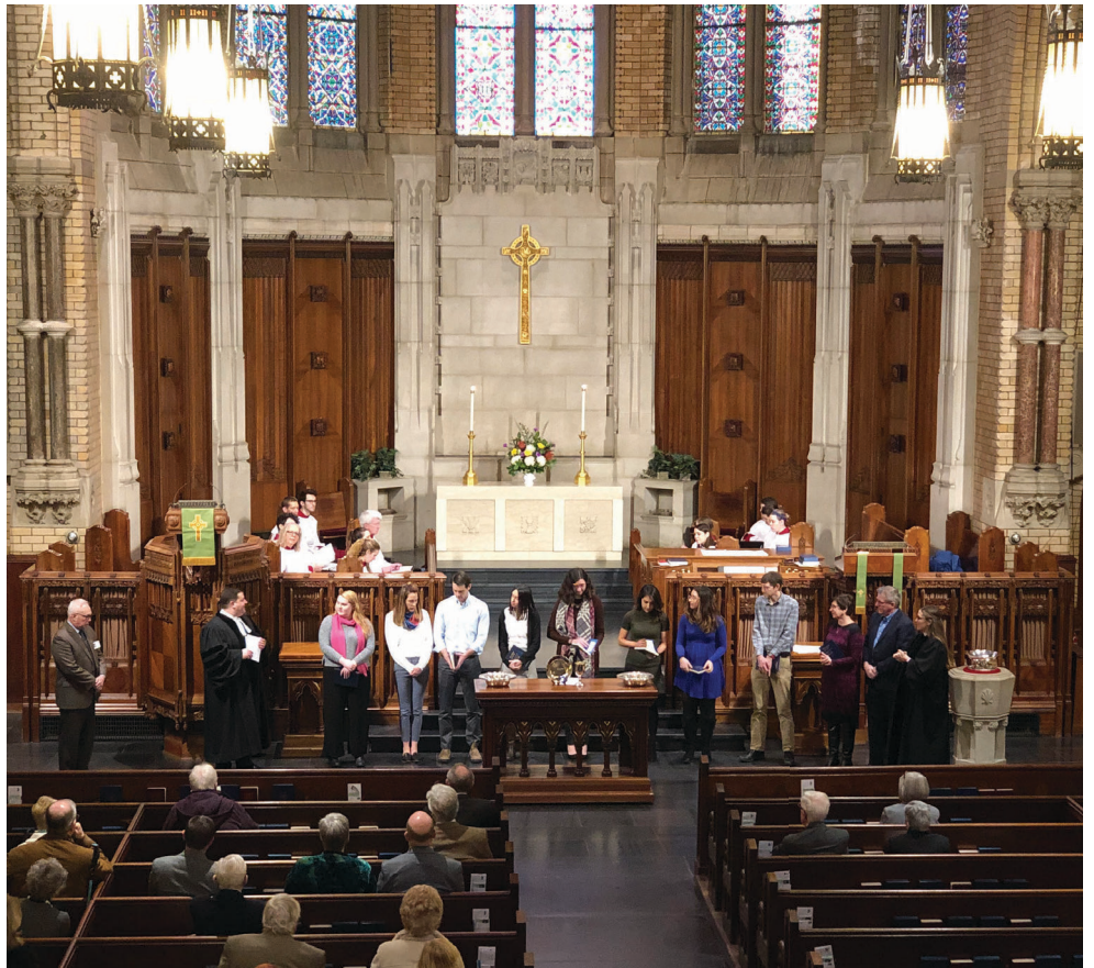
Introduction of new members, 11:00 Worship Service, January 27, 2019