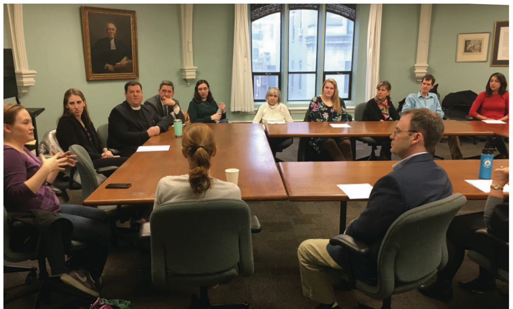
New Member Class, January 20, 2019

Dancing Classrooms Philly is an affiliate program of Musicopia. The Musicopia String Orchestra rehearses weekly at the First Presbyterian Church. Special thanks to the First Presbyterian Church for generously donating their venue to host Rock the Ballroom.