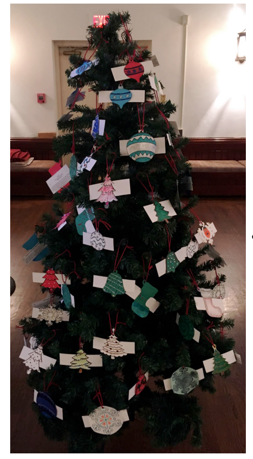
The Giving Tree, sponsored by the Twenties & Thirties Group of First Presbyterian Church, supports multiple programs at the Valley Youth House.