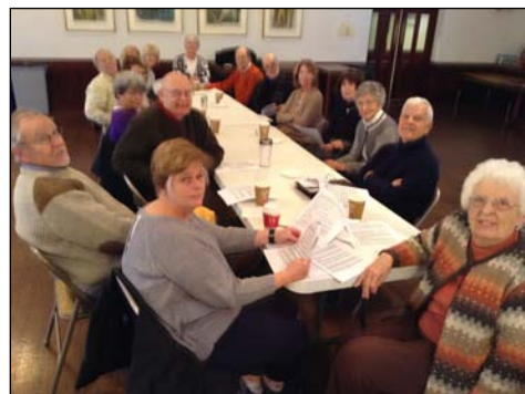
This is the new crop of Reading Buddies meeting on November 20 th in preparation for the first meeting with children on November 27 th .

Reading Buddies is a program pairing adult volunteers with young students for an hour of reading together each week. Reading Buddies at First Church is held on Mondays at 10 A.M. in Old Buttonwood Hall. We began with the children from Greenfield Elementary School on November 27. We invite anyone interested in being a Reading Buddy to contact the church office ( office@fpcphila.org or 215-567-0532).